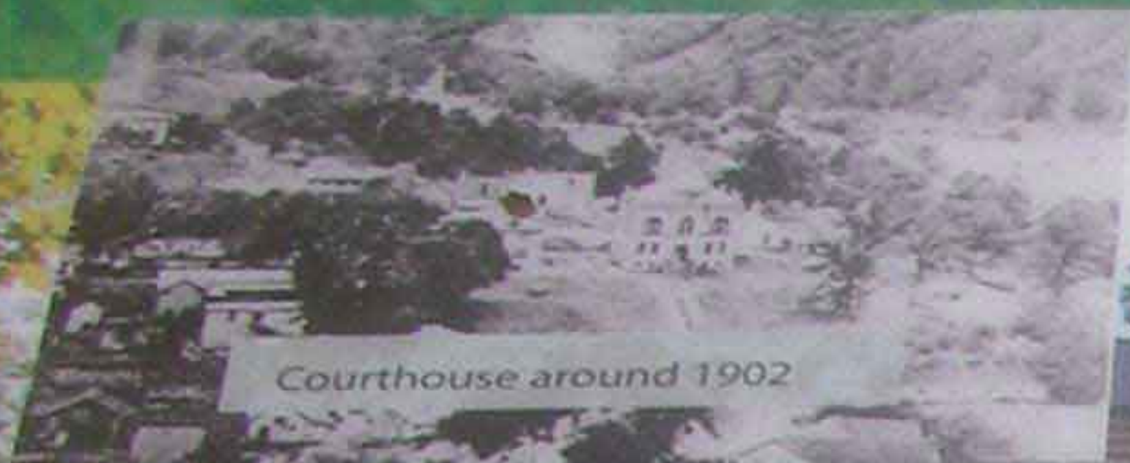
Courthouse around 1902