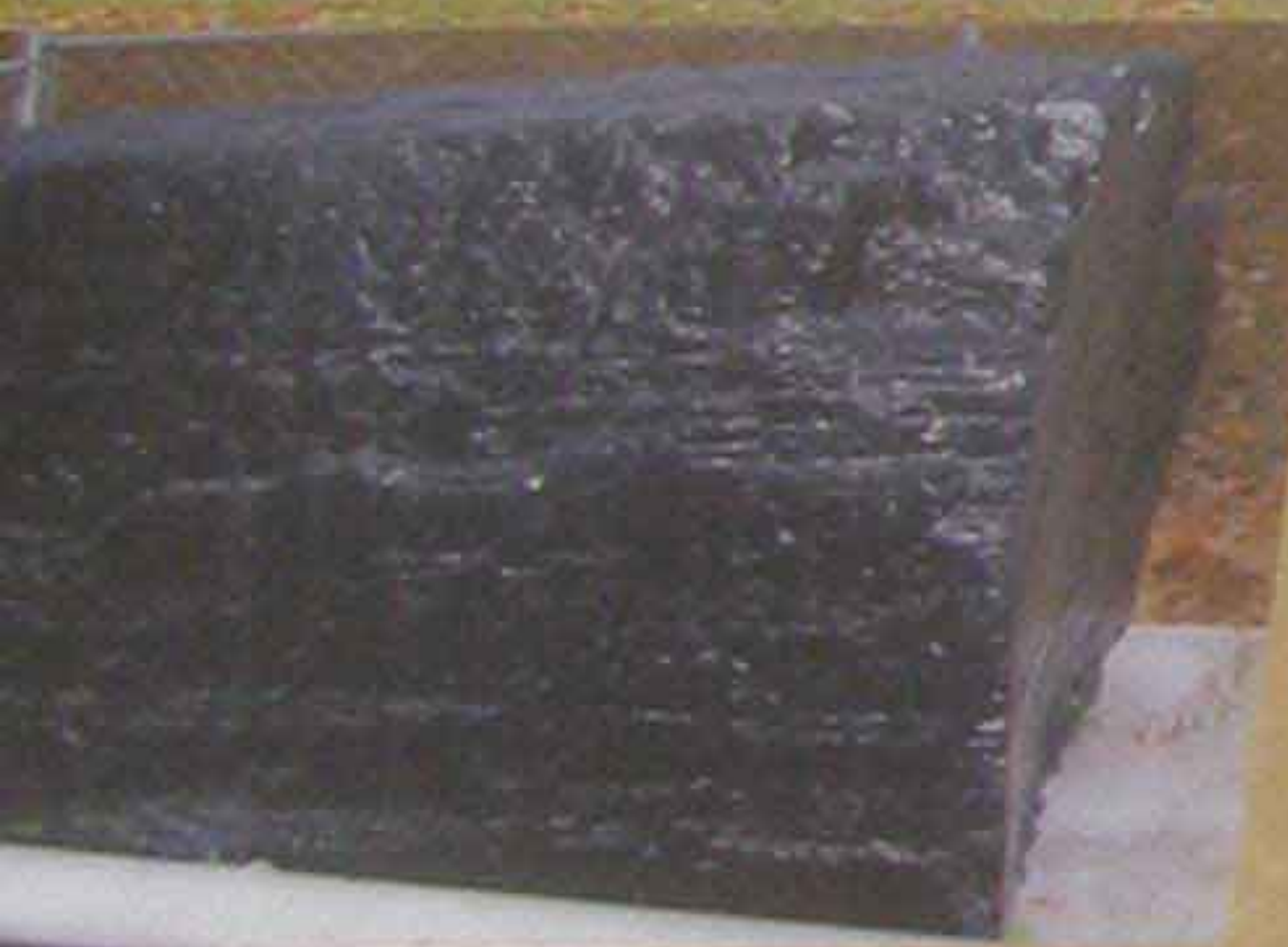
Block: This single block of coal mined from Curtin was here in the mid 1930s. It is a reminder of the history of Webster County.

The open lawn around the courthouse provides a park like setting. Explore court square.